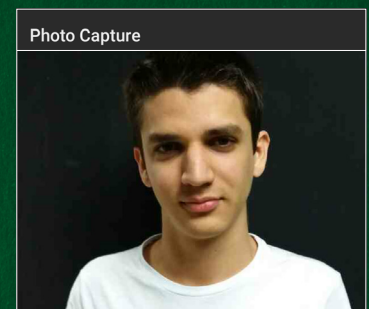
Capture employee photo at clock in/out, meal periods and rest breaks.