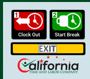
Red icon identifies to employee that they are now clocked in.